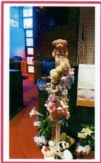
A BEANIE BABY TREE

Hebrews 13:16 16 Do not neglect to do good and to share what you have, for such sacrifices are pleasing to God.